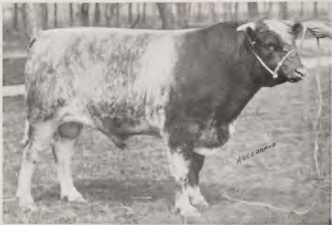
CORNER STONE 363116.